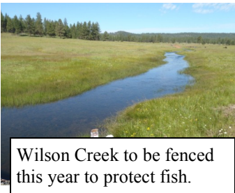
Wilson Creek to be fenced this year to protect fish.

Races, rock crawls and other events bring enthusiasts from all over the Northwest. The park has become a cornerstone of Morrow County's tourism efforts, and the economic benefits are spilling over into nearby communities, with merchants in Spray reporting a significant increase in business from park users. The park is also leased for grazing, under a management plan developed by the permittee, the County, and Oregon State University.