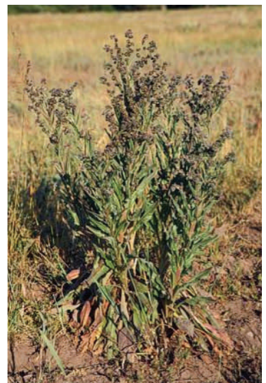
Below: Houndstongue plant in second year.