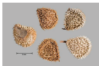
Below left: Houndstongue seeds. Seeds are about 5mm in size.

grazing, and drought stress. Mowing flowering stems before nutlets develop greatly reduces seed production. Maintaining pasture and rangeland health by preventing overgrazing and minimizing disturbance can help limit houndstongue spread and establishment.